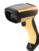
Portable handheld reader for reading 1D and 2D barcodes