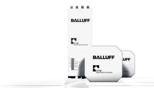
Antenna and processor unit of a UHF-RFID system for reading and writing over long ranges

There are essentially two identification technologies: RFID (Radio Frequency Identification using radio waves) and barcode readers (image recording and processing).