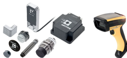
Read/write heads and data carriers in various form factors to match user requirements