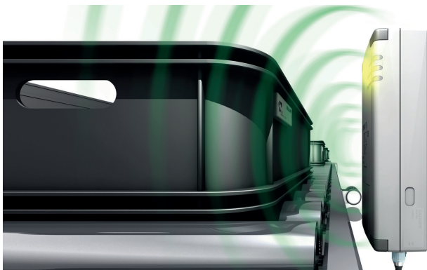
Reading and writing data carrier information on small load carriers using RFID for uninterrupted tracking

By using industrial identification systems you ensure that in an automated production process the right parts arrive at the right place at the right time and in the right quantity – for example in asset tracking, production control or intralogistics. These systems ensure quality and help you to reduce costs.