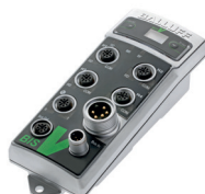
Frequency-dependent processor unit of an RFID system for operating multiple read/write heads or antennas