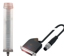
Selection of IO-Link capable intelligent actuators (here: signal light and valve interface)