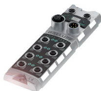
8-port IO-Link master for Profinet for connecting up to 8 IO-Link devices