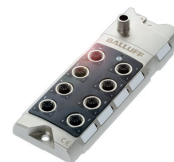
Sensor/actuator hub for connecting binary and/or analog sensors and actuators

The IO-Link-Master is the heart of the IO-Link installation. It communicates with the controller over the respective fieldbus as well as downward using IO-Link with the sensor/actuator level (gateway).