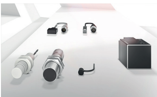
Inductive sensors will detect any metallic object.

You can reliably detect and inspect parts during transport with the help of suitable sensors – even under difficult conditions. Depending on the requirement you select inductive, photoelectric, capacitive or ultrasonic sensors. Photoelectric and ultrasonic sensors are usually used to detect objects located at greater distances (> 50 mm). Inductive or capacitive sensors are best suited for objects at a closer distance from the sensor (< 50 mm).