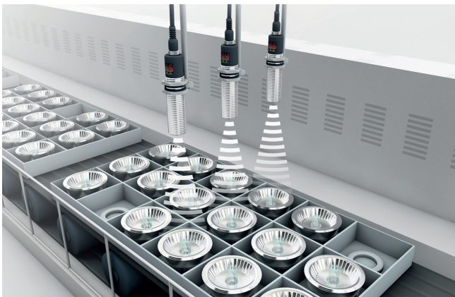
Parts are checked for presence, location and completeness during transport.

There are many ways in automation to detect, collect and position objects. You can use magnetic fields, permittivity – a material property –, light and sound to detect metals, non-metals, magnets, solids and liquids without contact. And you can do it over distances from 1 mm up to 60 m.