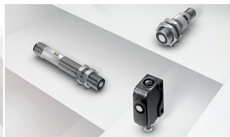
Ultrasonic sensors use sound to detect virtually any object regardless of color or composition.

Various technologies can be used depending on the application area: