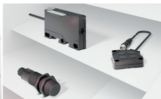
Capacitive sensors detect the presence or level of virtually any material or liquid.